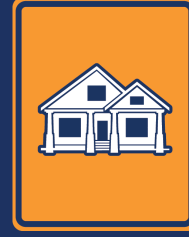
Change of Address