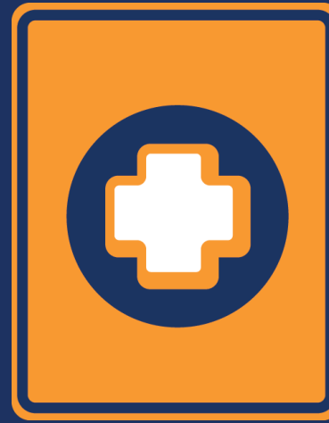
Loss of Coverage