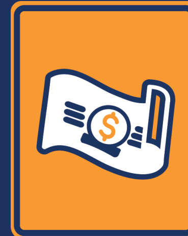
Extra Help (LIS)